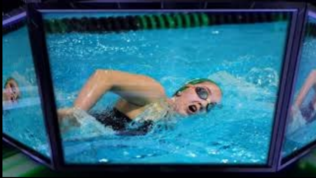
Awards Show Opening