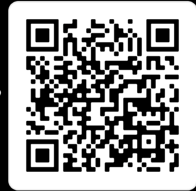
Awards Show Playlist