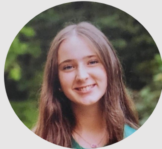
Lauryn Webb Sports Photography

Implementation (Individual): Embrace student athlete visions and support their ideas becoming reality.